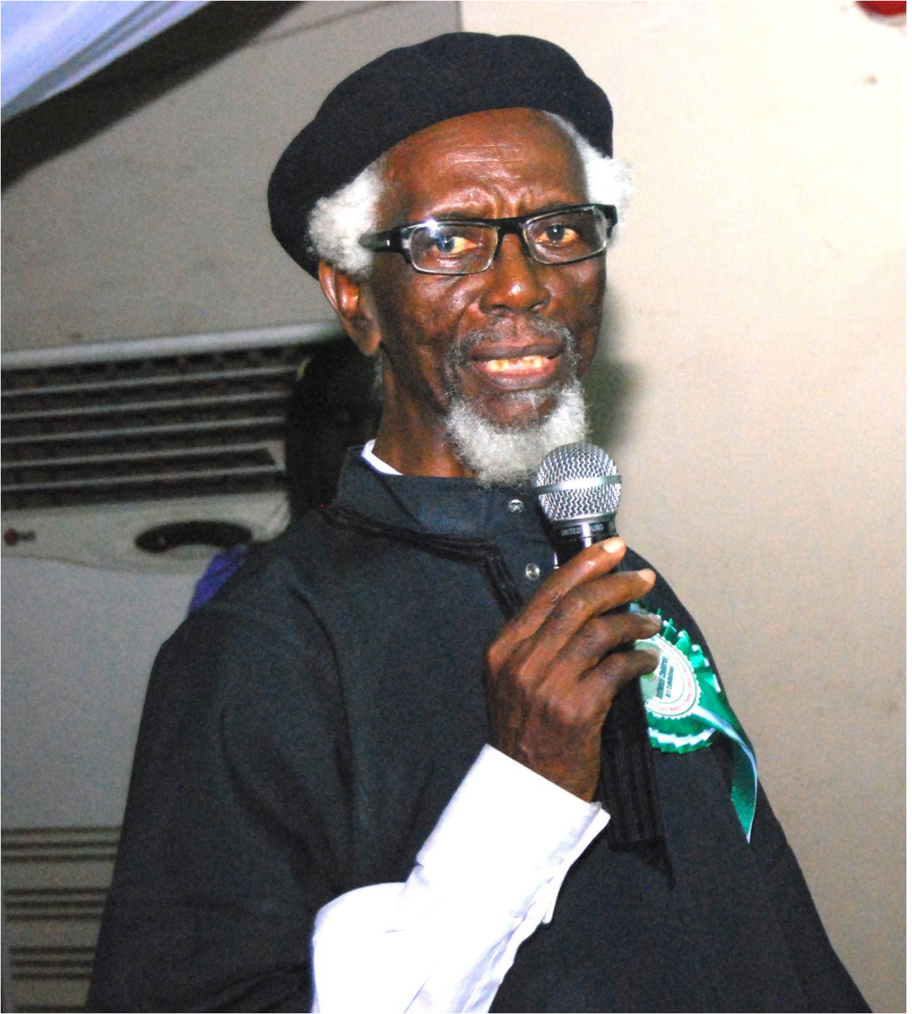
from African Art with Taj