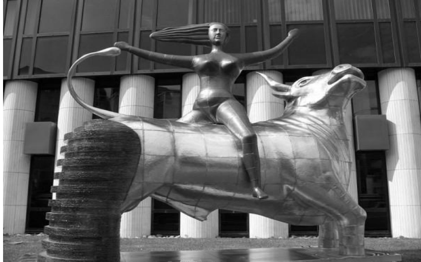
The symbol of women riding the beast(in form of EU parliament)

That beast in the book of Revelation represents the world government led by the Antichrist. By so prominently using the symbol of a woman riding the beast, the global elite are very clearly communicating that they are connected with this coming Beast system. They know what the Bible says when they use symbols like this. It seems like they are almost bragging about it.