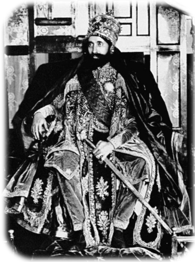
Ras Tafari Makonnen, the King and Heir to the Throne